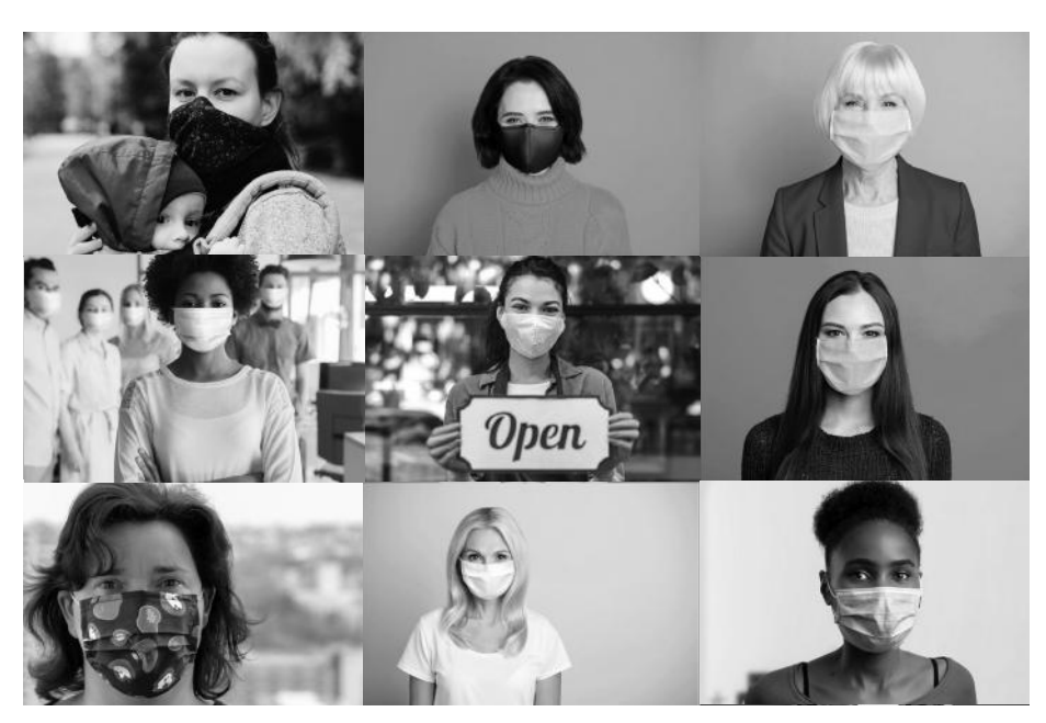
how our chapters connect pg 8

NIKE (ISSN 0271-8391, USPS 390-600) is published quarterly in September, January, May/June and May by New York State Women, Inc. (formerly Business and Professional Women of New York State, Inc.), 295 Weimar Street, Buffalo, NY 14206-3209. Subscriptions are a benefit of membership in New York State Women, Inc. Periodical postage is paid in Buffalo, NY and additional mailing offices. POSTMASTER: Please send address changes to NIKE Editor, 295 Weimar Street, Buffalo, NY 14206-3209. RETURN POSTAGE ACCOUNT at Buffalo, NY Main Post Office 14240.